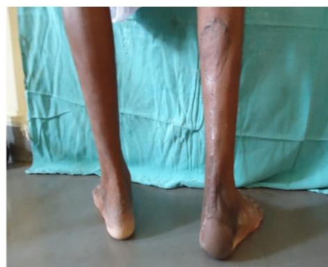
Figure -2: Pedicled reverse sural artery flap.